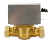
TWO PORT ZONE VALVE