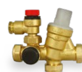
COLD WATER INLET SET